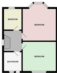
130 Bridgewater Drive Westcliff SS0 0DS

Call us on 01702 433663 to view this property or visit sorrellproperty.co.uk for more details